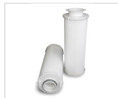
Approximate picture. End caps and height's choice will lead to the assembly of a product which could differ from those shown in figure