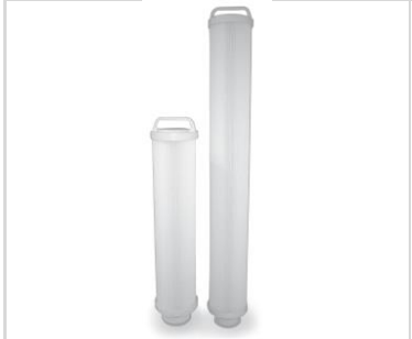
Approximate picture. End caps and height's choice will lead to the assembly of a product which could differ from those shown in figure