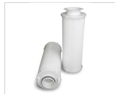
Approximate picture. End caps and height's choice will lead to the assembly of a product which could differ from those shown in figure