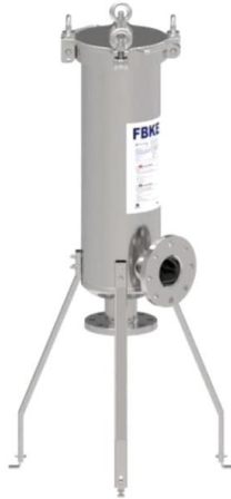
Approximate picture. End caps and height's choice will lead to the assembly of a product which could differ from those shown in figure