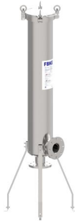
Approximate picture. End caps and height's choice will lead to the assembly of a product which could differ from those shown in figure