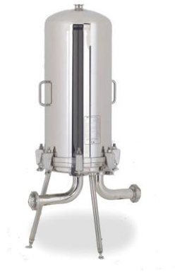
Approximate picture. End caps and height's choice will lead to the assembly of a product which could differ from those shown in figure