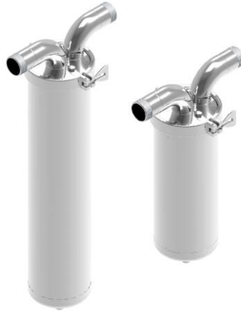
Approximate picture. End caps and height's choice will lead to the assembly of a product which could differ from those shown in figure