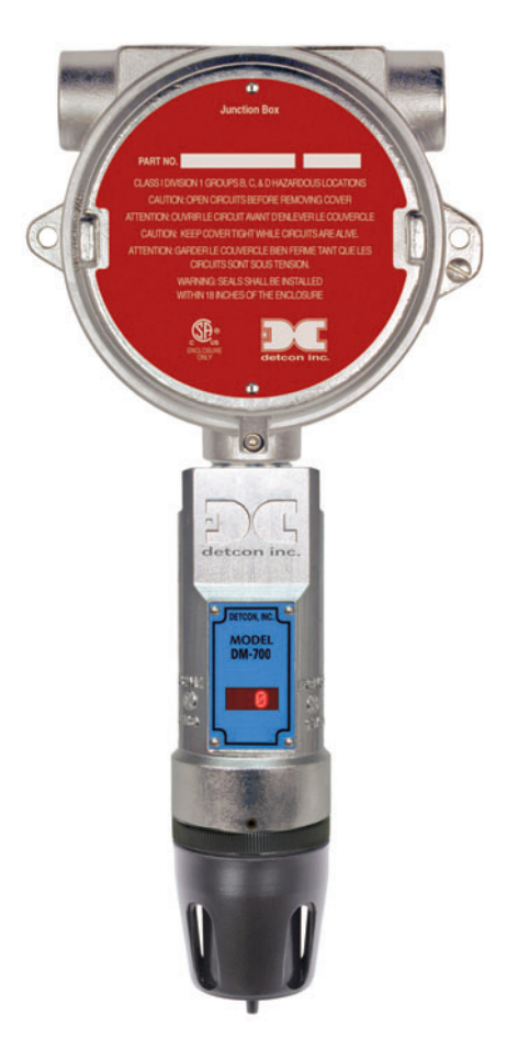
Scrolling Full Message/Text Display