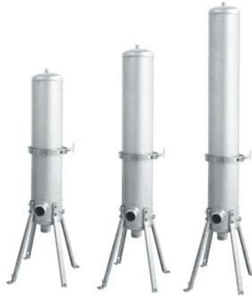
Approximate picture. End caps and height's choice will lead to the assembly of a product which could differ from those shown in figure