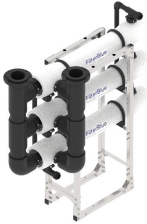
Approximate picture. End caps and height's choice will lead to the assembly of a product which could differ from those shown in figure

Link to product's details pictures, installation pictures