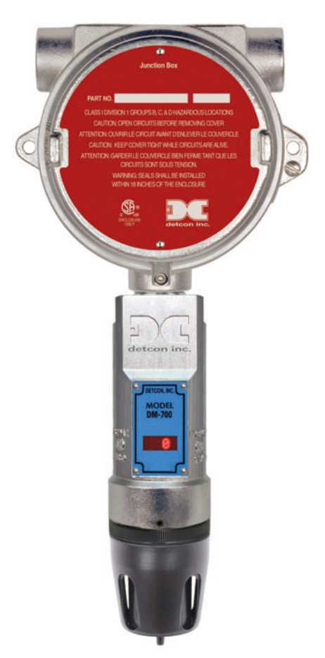
Scrolling Full Message/Text Display